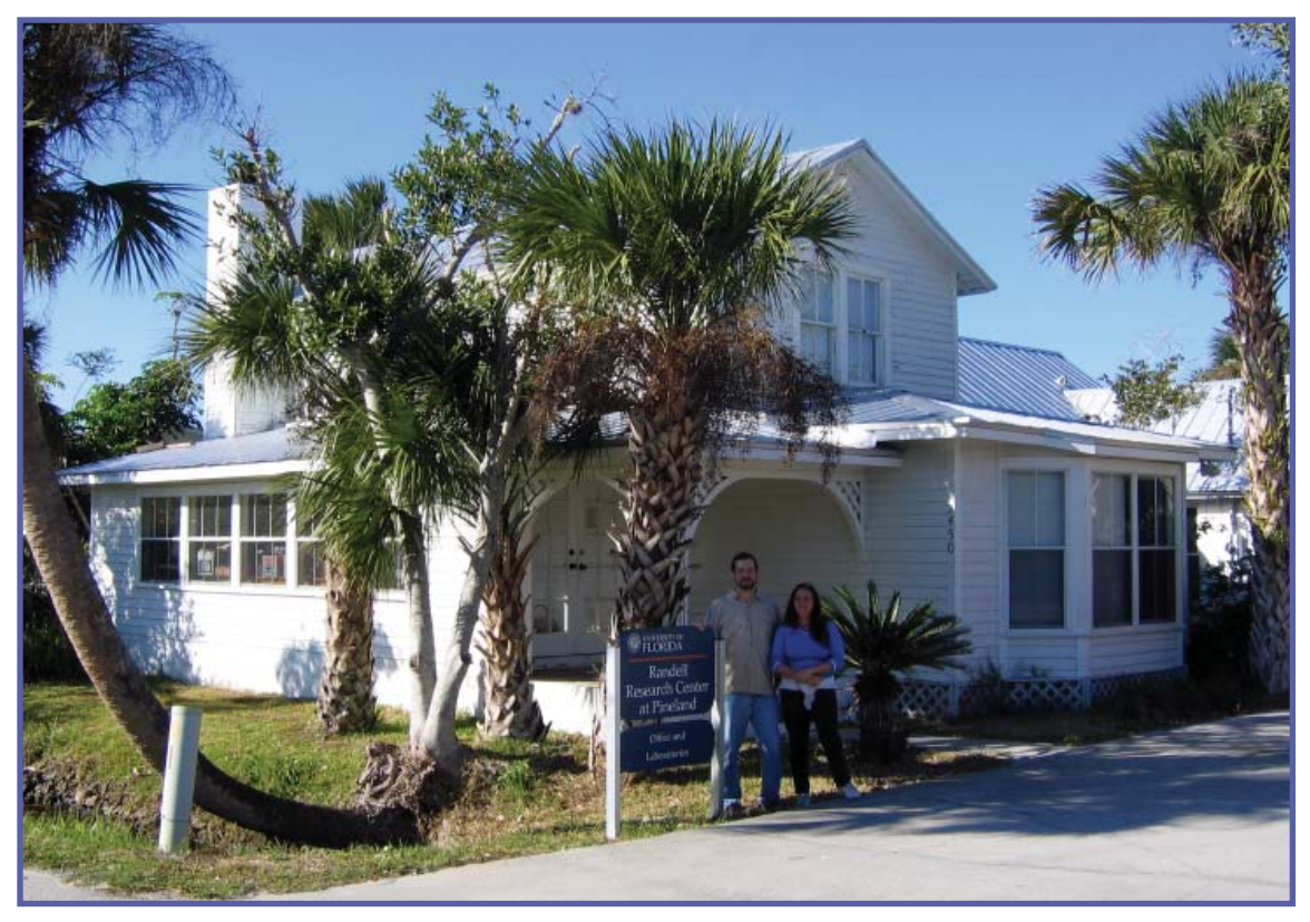
Randell Research Center at the Pineland Archaeological Site. Future home of the Pineland Regional Public Archaeology Center.

visiting public. The Pineland Center will be housed at the Randell Research Center at the Pineland Archaeological Site on Pine Island which has an established local public archaeology program. Each Center will deliver public archaeology services to a multi-county region surrounding their office location.