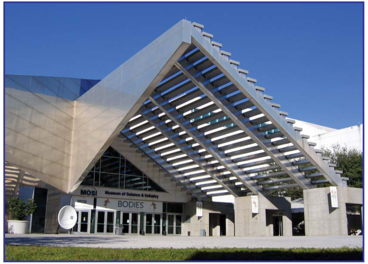
Tampa's Museum of Science and Industry and the location of the Tampa Regional Public Archaeology Center.