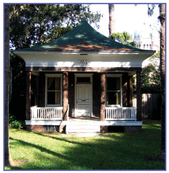
Markland Cottage on the Flagler Campus. Future home of the St. Augustine Regional Public Archaeology Center.