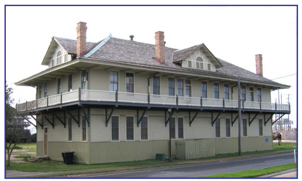
UWF's L&N Marine Terminal: Future home of the Coordinating Center of the Florida Public Archaeology Network.